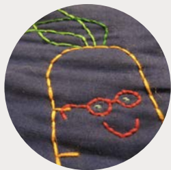
Embroidery sewing details with embroidery floss