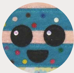
Appliqué sewing cloth shapes to the surface