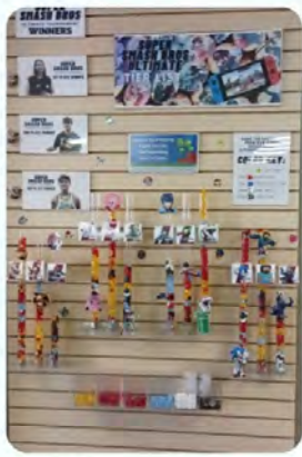
Gem, Vote, Voice!